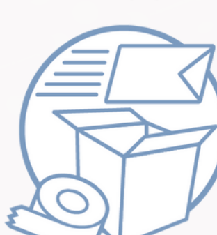
Packaging & Shipping Supplies