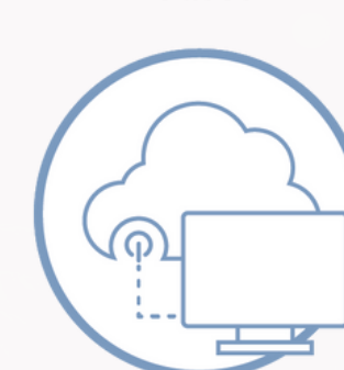
Software as a Service