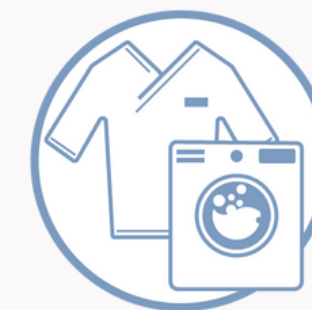
Uniforms & Linens