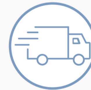
Small Package Shipping