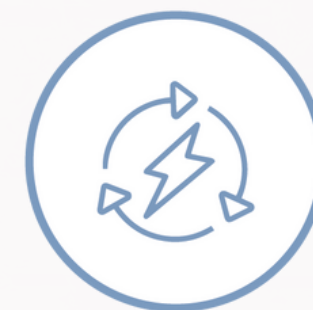
Electronic Logging Devices